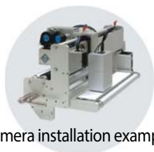
Camera installation example