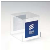
For Both Sides Labeling