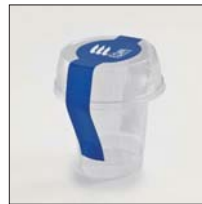
For Band Form Labeling