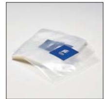
For Empty Bags Labeling

The specification may differ from conditions of use. Specification and other information are subject to change without notice.