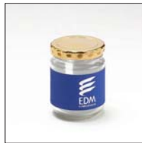
For Wrap-Around Labeling